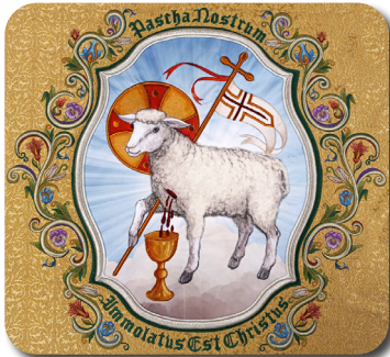
image of Our Risen Savior.

After we had our design – implementing it became our next challenge! There were so many “firsts” and “we’ve-never-done-it-that-ways” on this vestment, that it would be impossible to list them all. Very often, we looked at what had