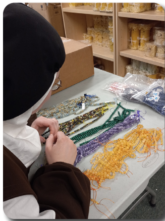
Checking quality on a new batch of beads

There are huge challenges here! First of all, of course, we must work with frequent research and orders to keep all of the different beads, bead caps, center medals, and crucifixes in stock. We must balance schedules and communication between the three or four different Sisters who might have their part in each the rosary before it ships. We must always be trying to make simple and pleasant on your end the experience of building/ordering the rosary. And we must always discover ways to streamline the whole process, especially with the increasing number of orders coming to us.